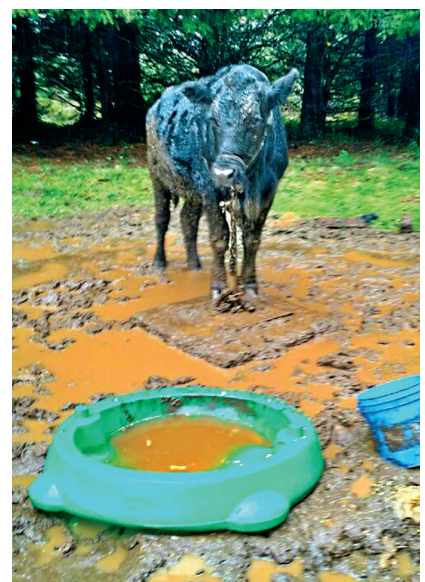
"Moose" now lives happily with other rescues from Sanctuary One after being found neglected and abused.

The animal control team in Del Norte County, a small isolated community on the California and Oregon coastline, know all too well how vital Sanctuary One is for ensuring safe adoptions. They responded to a neglect and abuse incident of a young Black Angus cow found in mud with no access to clean water or food. The agency quickly jumped in and rescued him. He was a big, friendly fellow, but the county was not equipped to keep him. Everyone interested in adopting him wanted to use him for slaughter; even the vet who did his welfare check said he should be butchered. The staff at the shelter refused, but they didn't have the means to keep him safe. They reached out to us and soon Moose, as we named him, joined Sanctuary One. Now Moose, whom someone described as a dog in a cow suit, lives with another Sanctuary One alum, Moo, a Jersey cow who was adopted in 2017 and two other Sanctuary One rescues, Bowie and Lennon, calves saved from the dairy industry meat market. Altogether they live in their new home, safe from neglect or mistreatment.