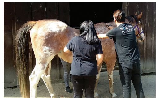
Maslow Project youth working with the animals on the farm.

And yet, because of you, she now has a new outlook and hope.