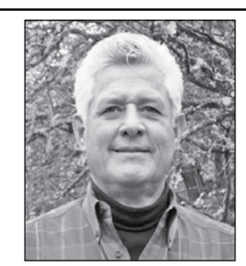
"Putting sellers together with buyers."