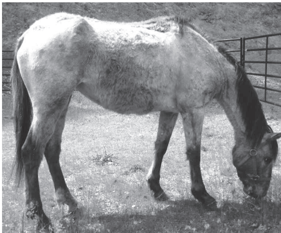
Rogue when adopted.

me as a source of comfort and safety and then begins to choose to come to me when I want her? It might take longer for this to happen, but the results are lasting and real.