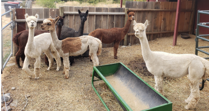
Patches, Caramello, Jazzmyn, Coco, Mindy, Marguerite, Rachel, Cassiopeia, Frostina