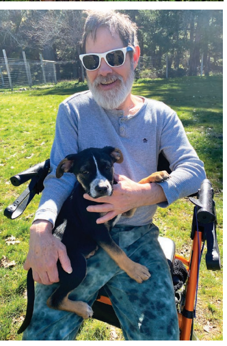
Top photo: Students working in the garden. Bottom photo: Puppy cuddles = great therapy at the care farm.