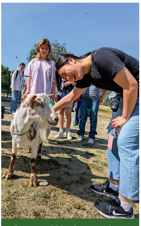
For many, visiting Sanctuary One is the first opportunity to connect with farm animals. Field trips offer the chance to find the joy in meeting care farm residents.