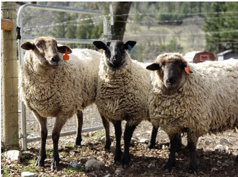
Manny, Moe and Jack

Fun Fact: Unlike wild sheep domesticated sheep do not shed their wool. Their wool will keep growing all over their body and they do not lose it unless it is sheared.