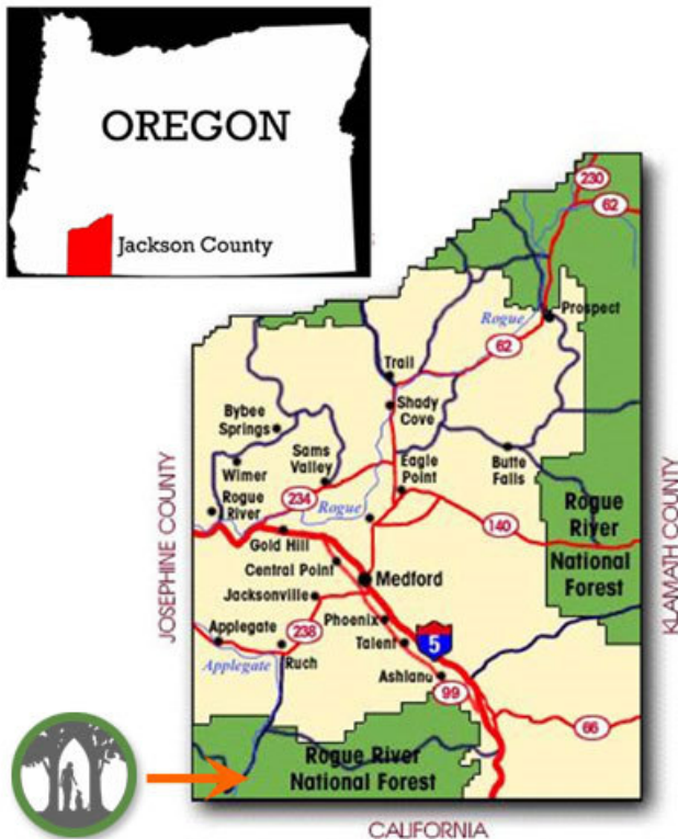
Approximate location of Sanctuary One at Double Oak Farm