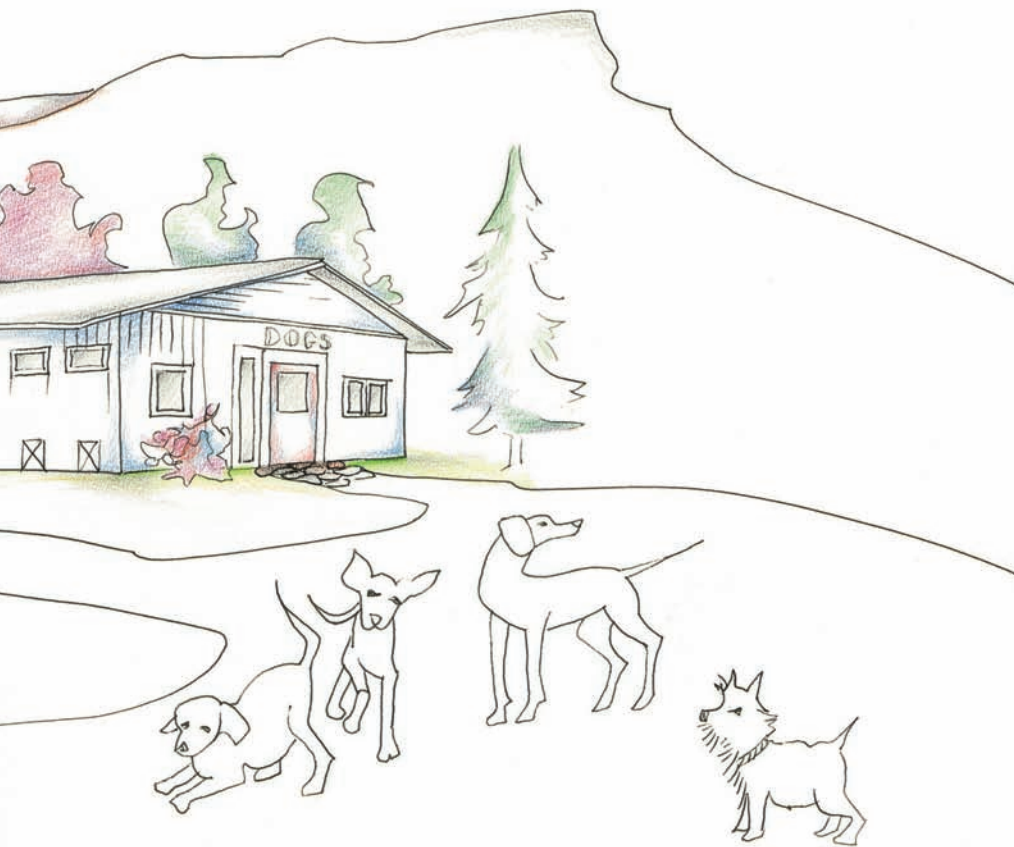
an artist's rendering of the Cat and Dog Village of Sanctuary One

ut community at Sanctuary Cat and Dog Village will be . Each cottage will have a large animals to hang out and enjoy company. This 'community living' deal for social creatures, and will nals feel at home. Both cottages private rooms in case we have prefer or require solitude. Each ven feature an expansive, fenced- ea so our residents can take in and spacious views.