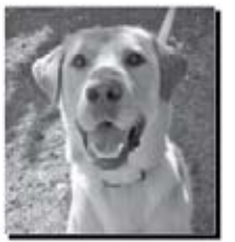
Ace is a happy 3-year-old male Yellow Lab. Case #1319