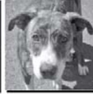
Brinny is a sweet 5-month-old female pup. Case #K2139