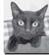
Pepper will add some spice to your life. Case #K0810

The Jackson County Animal Shelter is located at 5595 S. Pacific Hwy. 99, between Talent & Phoenix. Adoption Hours: 11-4 weekdays, Noon-4 weekends.