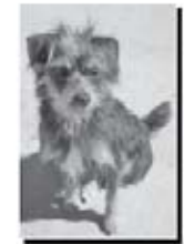
Drake is 2-year-old mix who weighs 10 lbs. Case #K2216