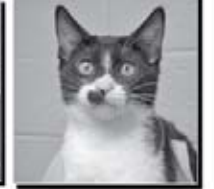
Rock & Roll are two 10-week-old kittens. Case #K1530