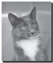
Socks has a neat kinked tail & grey and white fur. Case #K1949